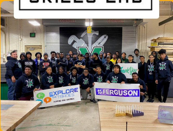
a 2022-2023 Skills Lab recipient.